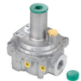
Pietro Fiorentini Regulators