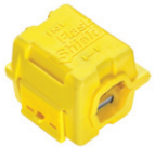
Jacket Stripper Tool