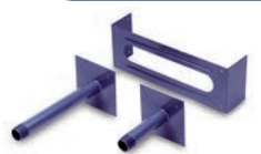
Straight Stubs & Stub Bracket