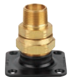
Termination Fitting with Square Flange