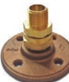
Termination Fitting with Bronze Flange