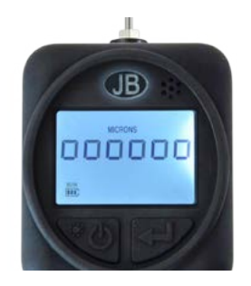
Atmospheric Pressure -Normal operation mode