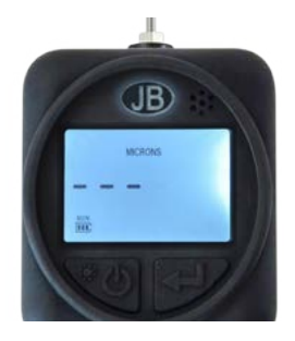
Loading Menu – Warm up mode

The unit will display "oooooo" when it is at atmospheric pressure, or at a pressure over 100,000 microns. This indicates an over range condition. When the pressure is at 100,000 microns or lower, the gauge will display the value.