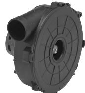
FIG. P A211