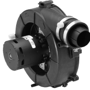
FIG. H A202