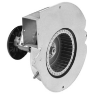
FIG. M A208