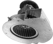
FIG. F A200