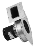
FIG. Q A217