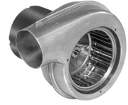
FIG. E A164