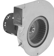
FIG. O A210