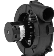
FIG. J A204