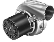
FIG. B A135, A205