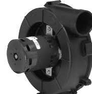
FIG. I A203