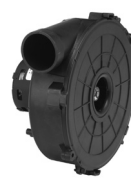
FIG. N A209