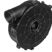
FIG. D A163, A213, A216