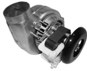
FIG. A A068