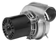
FIG. G A201