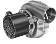
FIG. C A138