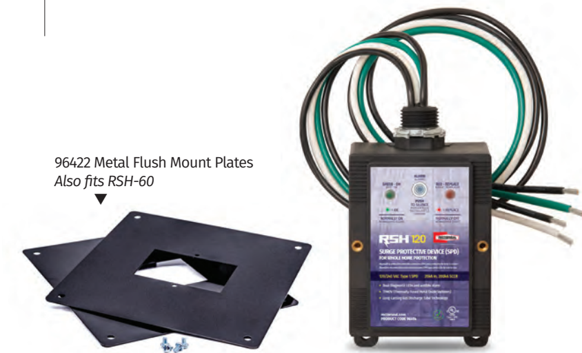
96422 Metal Flush Mount Plates Also fits RSH-60