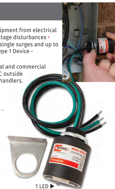
1 LED ▶